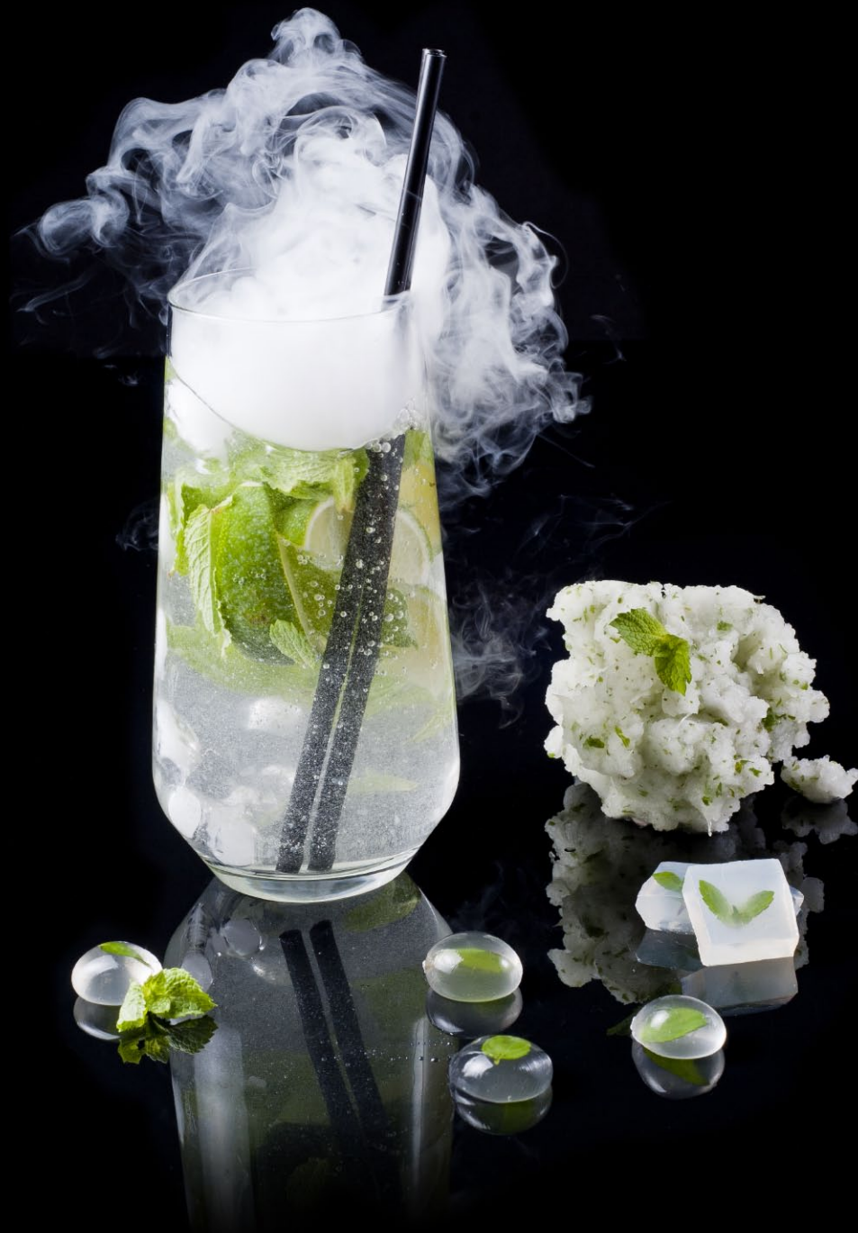
Mojito in four ways