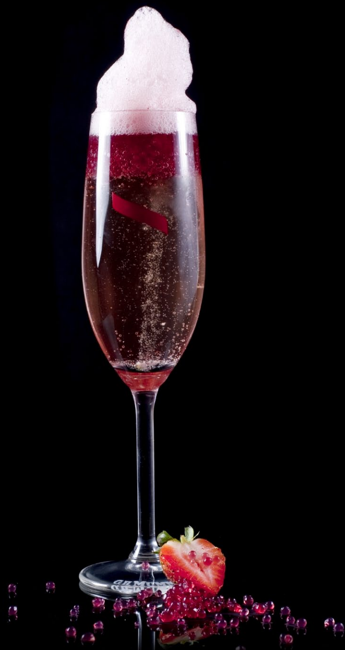
Yakamoz - G.H. Mumm champagne served with strawberry caviar, finished with white chocolate mousse.