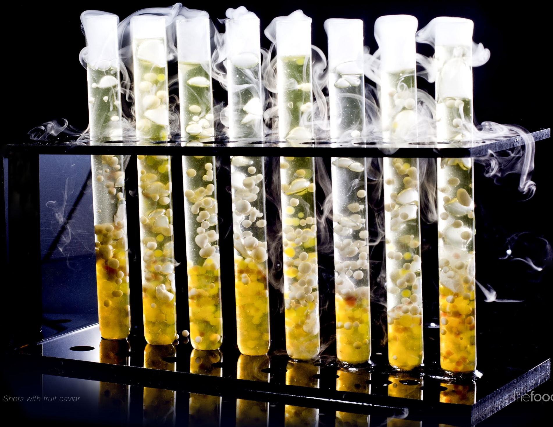
Shots with fruit caviar